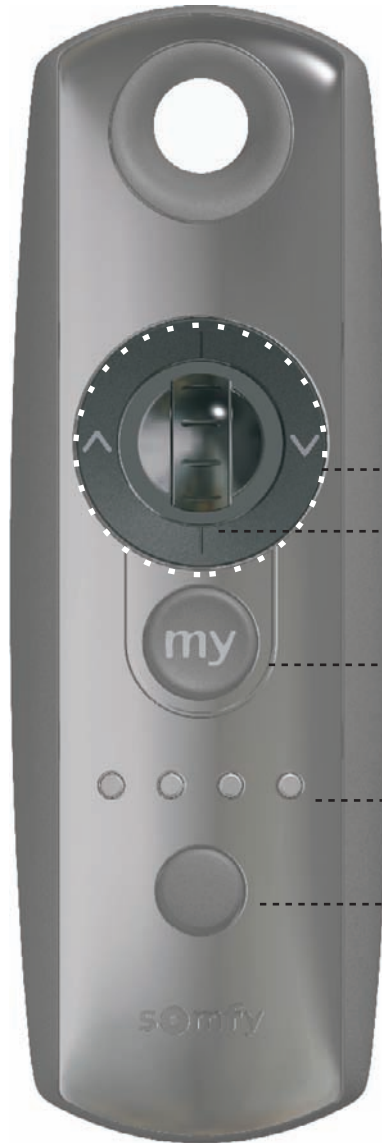
Shown in Full Scale Telis Modulis RTS Lounge Also available in Silver Finish

Control individual blinds or individual groups of blinds with a multi-channel remote. For example, program each of four blinds on a separate channel for individual control and use the fifth channel (master) to operate the blinds as a group.